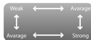
Figure 3. The team composition should avoid only consisting of students on same level

Some structures of Cooperative Learning support discussion in teams, while others aim at assisting in sharing knowledge, gaining knowledge, evaluating and rating concepts, or simply delegating specific tasks. “Meeting in the middle”, “Roundabout feedback”, “Role brainstorming” and “Value lines” are just some of the approximately 50 structures of Cooperative Learning [9] that could be activated in the course. In addition to imposing the learning structures onto the students, the composition of the teams should also be carefully carried out. Heterogeneous or multidisciplinary teams are emphasised in order to spawn better and richer discussions. This fits well into the agile processes, as software development teams working with agile methods are often multidisciplinary and stresses the importance of diversity in the team.