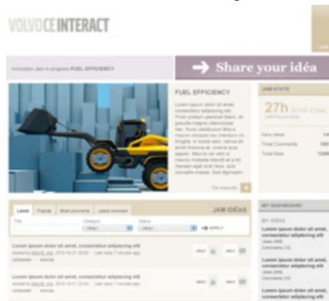
Figure 1: Version 0.5 Jam discussion

Version 0.5 was built to run one Innovation Jam in 2010 [20]. The topics for the Jam were selected by the executive management team and supported by experts in the company. The platform layout had an introduction to the topics, called injection, with a small description and additional documents for reference and inspiration. Everyone was invited to share ideas: an announcement was spread on the company intranet, aiming to bring everyone onboard. There were also two webcasts from executive management where the importance of innovation was emphasized, encouraging all employees to contribute. The Jam happened in a very specific time frame. After this period no input could be added; the discussion and ideas would proceed to be evaluated by an employee who is an expert in the topic. The expert would analyze, synthesize and suggest ideas for further evaluation and development. The first Jam resulted in 184 ideas, about ten were selected as "winning ideas". For all these ideas further exploration was initiated and funded, and at least some of the ideas were developed into functioning prototypes. The executive manager reports that when the support group was assigned to follow up the investigation projects, the success rate increases [33].