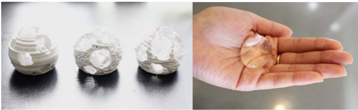
Figure 2. Coral3 by Nell Bennett – Figure 3. Ooho! by Paslier, Couche and Garcia Gonzalez