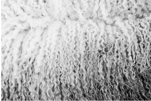
Figure 1: A clear picture of crimp of wool fibers

diameter of more than 28 micron is too coarse to be comfortable in next to skin garments [1]. Coarse wool is therefore mostly used in other products, and the lowest qualities go into technical products like house insulation. Wool fibers are covered in scales (Figure 2) which are the reason why wool will felt when exposed to heat, water and mechanical movement.