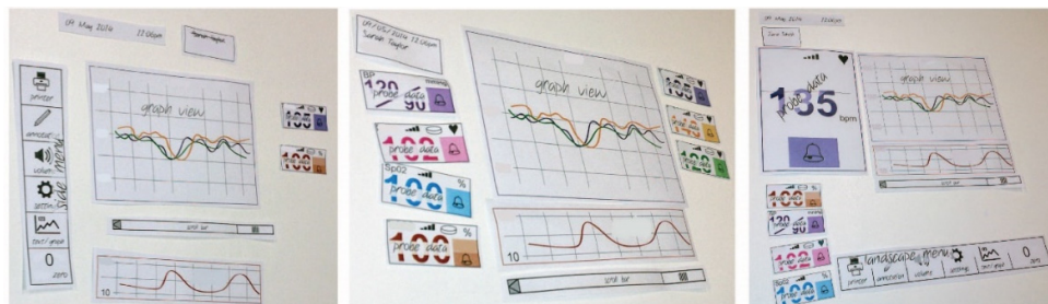
Figure 2. Three screen designs by participants (note that elements of the design have been removed for confidentiality)

Each study was video and audio recorded, in addition the screen and data container designed by each participant was photographed. The data was collated and compared to produce a summary of findings. Three of the screens constructed by participants are shown in Figure 2.