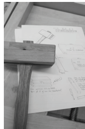
Figure 3. Mallet

After the course at Skedsmo videregående skole, the group helped in an activity at Bråtejordet lower secondary school in Skedsmo to develop design and handcraft competencies. Two of the group members who work in this school helped guide the design process, and everyone in the group could choose if he/she wanted to work with ceramics or wood. While we worked, we had many educational discussions about tools, techniques, design development, processes and evaluation.