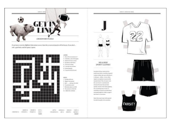
Figure 2. "Subculture Blueprint," Poster