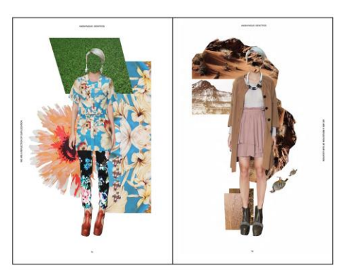
Figure 1. "Anonymous Identities", Visual Essay

The essay concluded by questioning what makes subcultures distinctive and provided direction for a second project, "The Subculture Blueprint" (Figure 2). In this poster, she created drawings of objects associated with various subcultures and positioned them on a map divided into quadrants representing binary concepts. With this project, she demonstrated that even the most diverse subcultures are interconnected. In the third and final project, the student took a humorous approach by designing an adult activity book, "Identity Instruction Manual" (Figure 3) using paper dolls, clothes and objects, interspersed with information-rich games related to characteristics of various subcultures ("the raver," "the preppie," "the jock," "the skater," etc.) The book prompts the user to find relationships between the subcultures to customize identities based on the information and objects provided in the activity book.