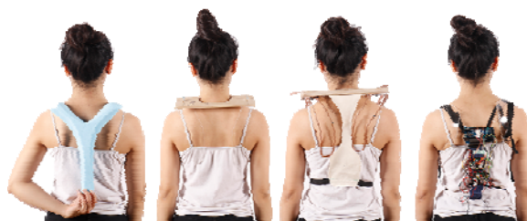
Figure 7. Different stages of prototyping the concept of a wearable device that provides tactile feedback that lets the user know who is romantically interested in them

When narrowing down we decided to focus on romantic interest, and realised that a wearable device was the best way to move forward. From here we branched out again, but now with a clear focus on what it was that we wanted to create as our final outcome. This stage was about supporting initial experiments with proven scientific facts and adjusting the experience that we wanted to create by doing several user tests (Figure 7).