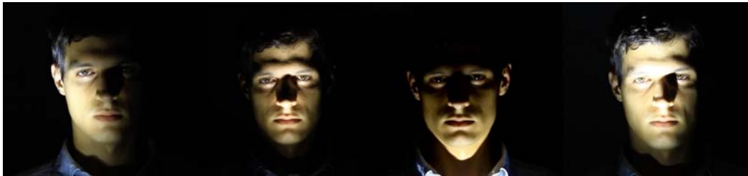
Figure 6. Effect of light projected at different angles

This project came from the XY module that expects students to embrace current scientific advancements to create an innovative vision on how this technology could be applied in the nearby future. We partnered up with the nanotechnology department at Imperial and were introduced to their laboratory facilities and research. Our team spent many days researching in depth about nanotechnology. We had a general understanding, but struggled to connect this to any future vision. After days of frustration, we switched our approach and looked into topics that we were interested in, not necessarily related to any kind of technology. We ended up focusing on makeup and why/when we decide to use it. We were discussing that light has an effect on how we look and that was enough for one of our team members to decide it was time to improvise. We took some fabrics and lights with us, and we locked ourselves inside a dark room and flashed lights at a teammate's face (Figure 6) I was not familiar at all with this approach, and did not see any relations between makeup and our sudden idea of a lockup, and find it even harder to relate it with the goal of our science-led project.