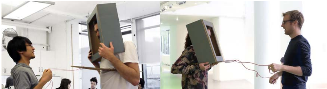
Figure 3. Prototype to test users comfort distance for a teleconferencing experience

During this stage we split into two teams to perform social experiments related with teleconferencing interactions. Testing included understanding the distance at which people wanted to interact. For this we created a screen prototype that framed our faces with two emerging ropes. The interviewed people were requested to decide at what distance they wanted to interact with us, considering it a teleconference call by pushing or pulling the screen further away (Figure 3).