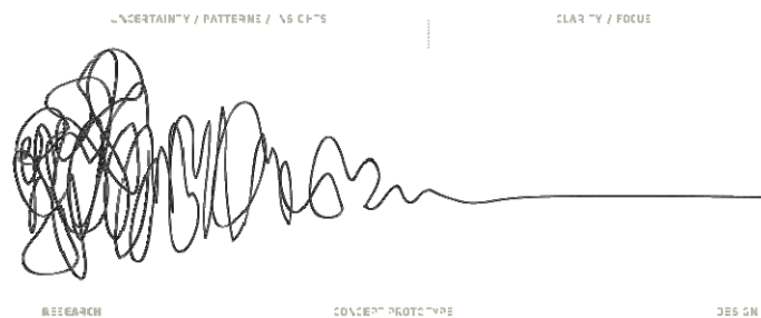
Figure 1. Newman Design Squiggle illustrating the design process [6]

There are a wide range of design processes that have been documented as representative of practice. Examples include a systematic engineering design approach [3], the total design approach [4] and double diamond [5], as prominent exemplars. These typically involve phases of activity and iteration with information occurring at some later phase resulting in the need or opportunity to revisit a prior phase in order to address an issue or/and improve the outcome. In addition to these classic design models, some researchers have noted a non-linear or haphazard approach to design (Figure 1).