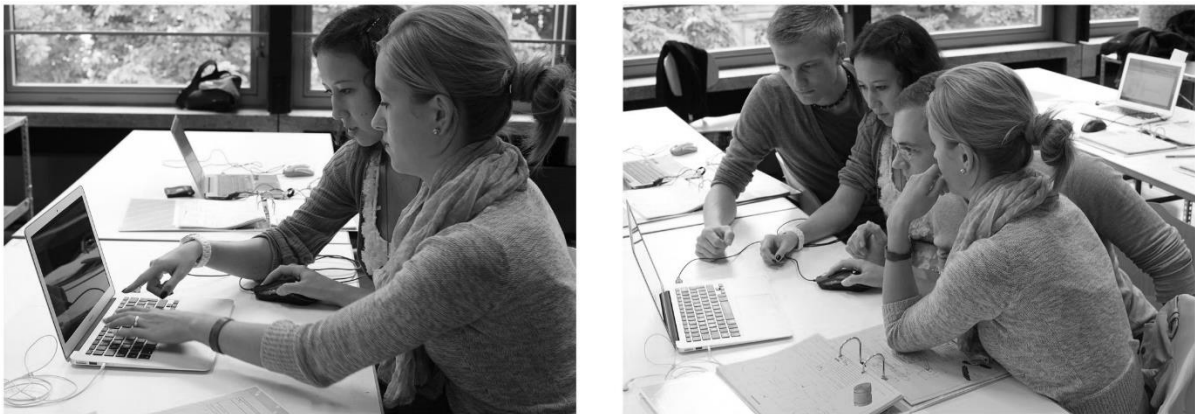
Figure 4. T 4 - Team-tutoring in learning group of four

Facilitated by this system of support, in each classroom up to 40 students in 10 groups are perfectly supported by one tutor, a quite cost-effective system.