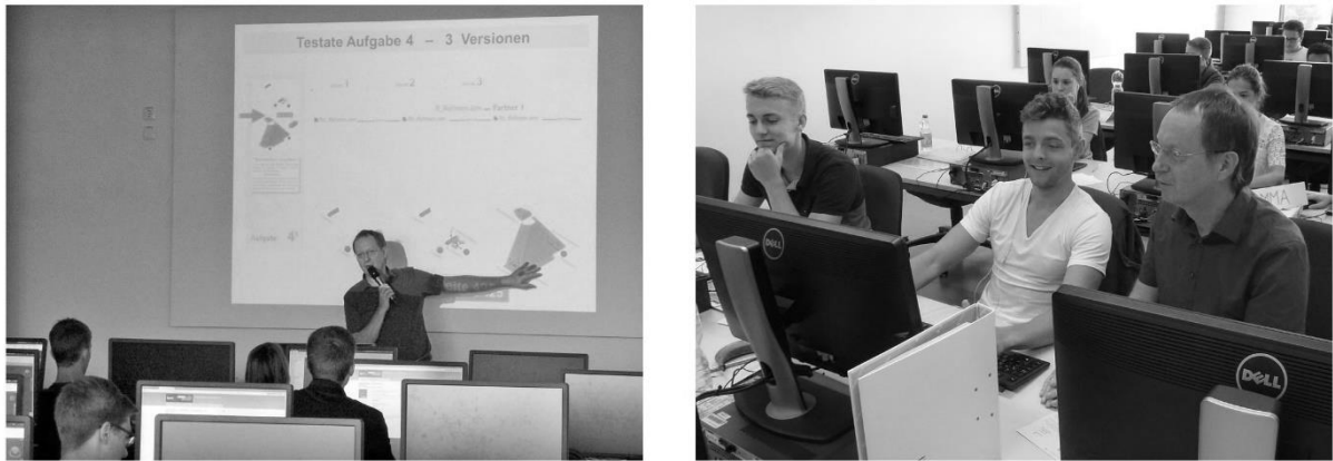
Figure 6. T 6 - Trust in the lecturer and concepts taught

With all these actions, the lecturer builds up trust and trust accelerates the learning progress of his students (Figure 6).