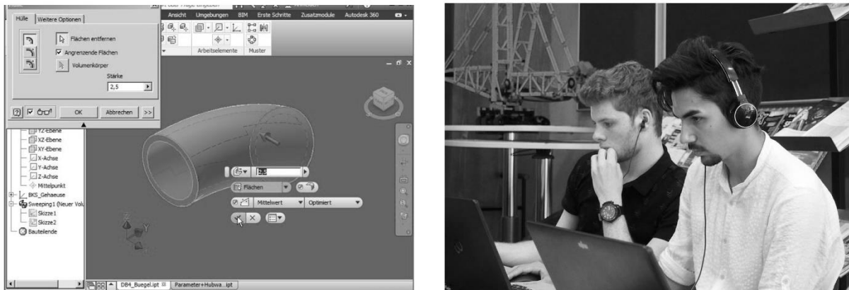
Figure 1. T_1 - Tutoring via video presentation and application via structuring

Our goal is that most students watch the complete video fully focused (Figure 1 right). Only in the exceptional case, that someone is not able to grasp the idea after a one-time view of the video a second view of the video may be helpful.