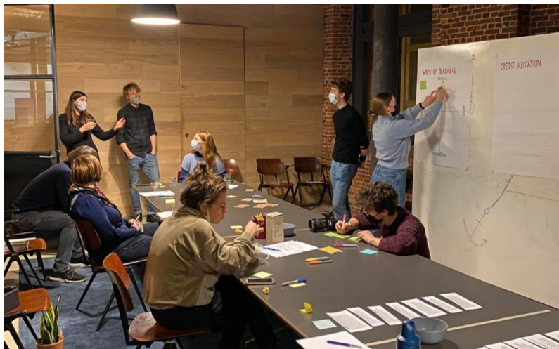
Figure 1. Workshop with SD agencies

The workshop started off with two warm up activities. The first was the creation of a word cloud with key words defining SD. During the second, the participants were asked to each note down what the timeline of the service design journey looked like to them. These activities not only allowed to get the participants to start thinking about the topic, but it also allows us to gauge how uniform the perception of the field is across different members and compare this to existing literature.